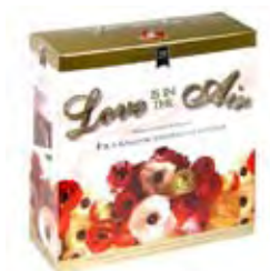
Love is in the Air

A romantic mood setting kit for lovers. Contains: Scented Silk Flower Petals of assorted colours, Citrus Almond Massage Oil, Incense Cones & Heart Shaped Holder, Invitation, Tealights & instruction insert. All packaged in a cream organza bag.