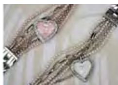
Hearts and Pearls

A selection of watches bracelets necklaces and earrings for her